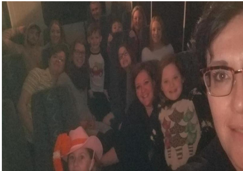
Delivering Cookies to Law Enforcement, Health Workers that work and miss Christmas